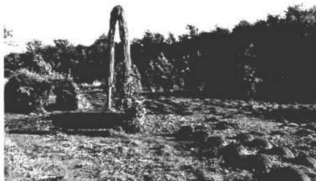
New Archway into tyre maze