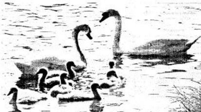
One of the last photos of the Swan family

We now have to make sure that no wandering males (or pairs) try to take over the territory. Until the cygnets grow up they are very vulnerable; they have no flight feathers and the female has shed hers - this is to enable the whole family to fly at the same time later in the year. Hopefully, all the youngsters and mum will survive.